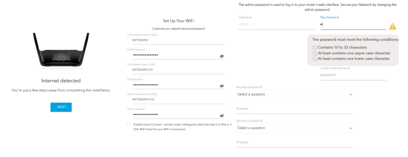
Figure 6: Setup Wizard detecting the Internet and configuring network automatically (Left), guiding user to set Wi-Fi password (Middle), guiding user to set administration password (Right)