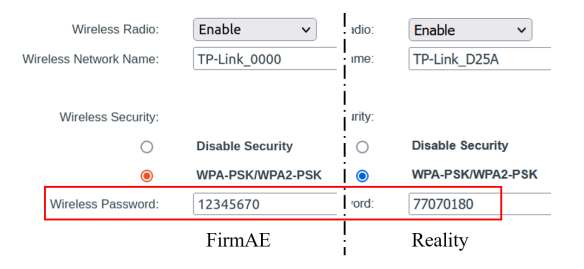
Figure 3: The Wi-Fi configuration page of TP-Link TL-WR940N in FirmAE and a real device

issues primarily due to the absence of required values normally found in flash.